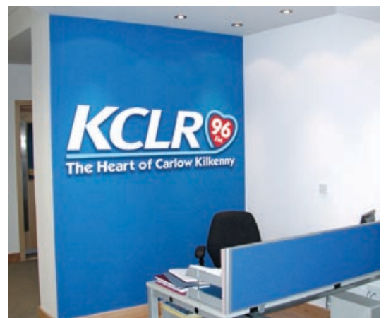
Flat Cut PVC Letters KCLR Headquarters, Kilkenny