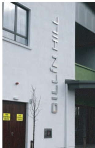
Cillin Hill, Kilkenny Stainless Steel Built-up letters