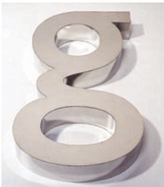
Polished Stainless Steel Built-up letter