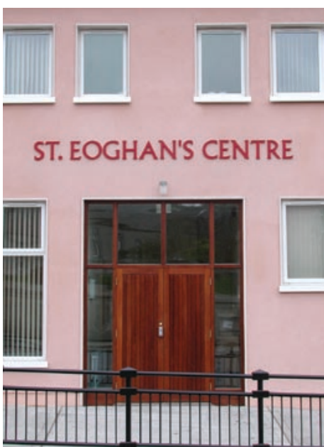
Flat Cut PVC Letters St. Eoghans Centre, Kilkenny