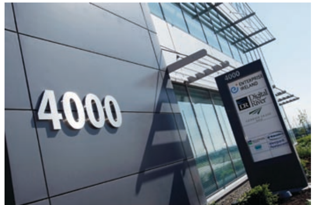
4000 Building, Westpark Shannon, Shannon Stainless Steel Built-up letters