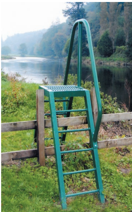
Safety stile in situ at Inistioge, Co. Kilkenny