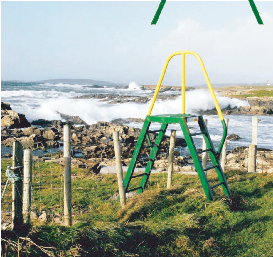
Safety stile in situ at Eyeries, West Cork

Signiatec Safety Stile has a complete aluminium construction and conforms to British Standard (Test Date - March 07)